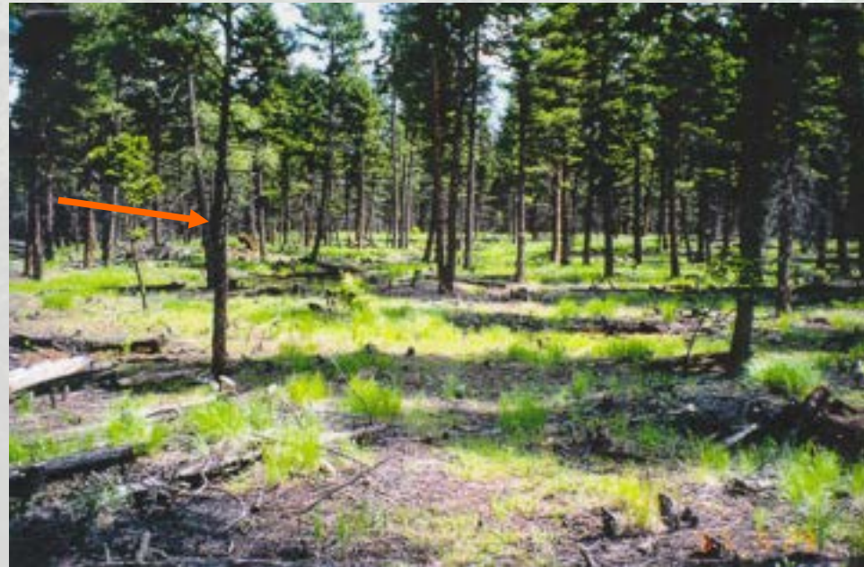
3 Years After